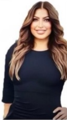
Ceci Truman Candidate US 25 th Congressional District